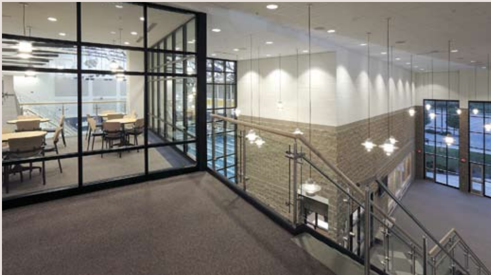
SPECTATOR ENTRY AND CONCESSIONS