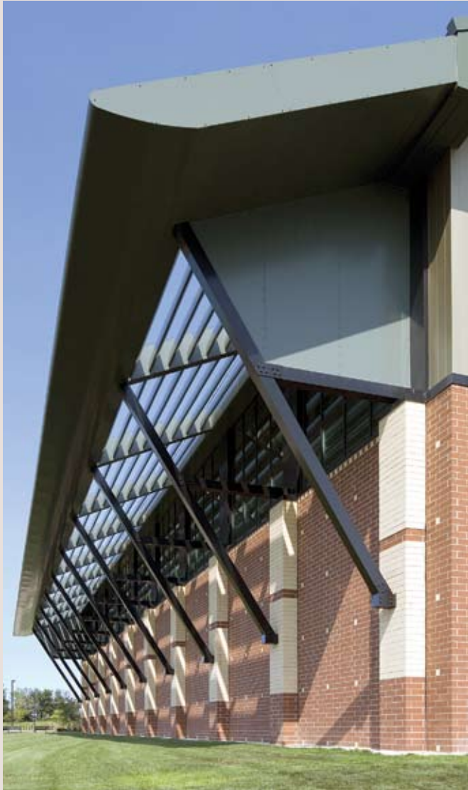
SUN SHADES AT NATATORIUM