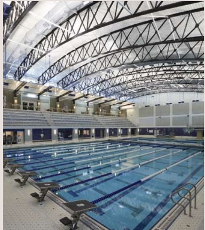
COMPETITION SWIMMING VENUE

ZPS required the new natatorium to provide a competition venue rivaling collegiate facilities. Details were developed that provided the athletes with a competitive advantage. The natatorium houses a 10-lane competition pool; 16 practice lanes; two one-meter, and two three-meter springboards; and competition and practice water polo. The pool includes a movable bulkhead providing for a 33.3-meter, 25-meter, or 25-yard competition length. The 25-yard pool width provides 16 lanes of swimming in the perpendicular direction. Competitive speed of the pool is enhanced through a wave-reducing gutter design, eight-foot pool depth, and under-floor inlets. Other features include state-of-the-art 21-foot by 11-foot full-color LED video/electronic timing system with custom RJP starting