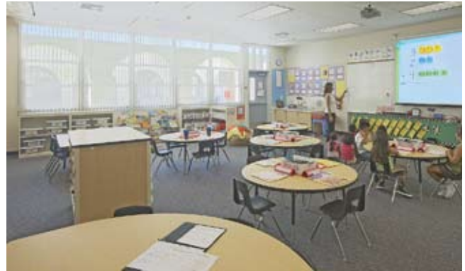
CLASSROOM IN USE

The updated prototype elementary school is pursuing CHPS certification, and was designed to use 23.4 percent less energy than allowed under the updated Title 24 code, according to Sally Muir of San Diego Gas & Electric. This qualifies it to participate in the Sustainable Communities Program at SDG&E, earning the district a 20 percent incentive bonus. More important, the school's energy saving features are expected to save the district up to $36,308