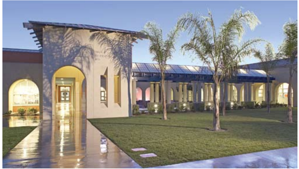
WOLF CANYON ENTRANCE

Wolf Canyon Elementary is a public school with a private school feel, accented with covered walkways and graceful arches inspired by famed San Diego architect Irving Gill. Eye-catching exteriors complement the energy-efficient and sustainable processes occurring within, making this attractive public school also one of California's greenest.