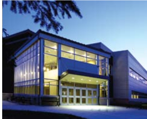
EXTERIOR VIEW OF MAIN ENTRANCE