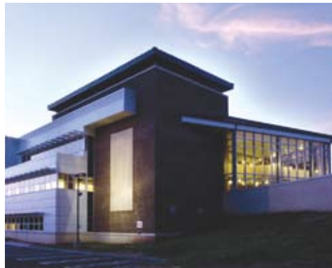
EXTERIOR VIEW OF REAR SIDE BUILDING