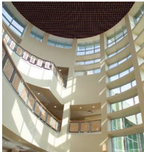
NATURAL DAYLIGHTING IN THE ATRIUM

building dedicated to the nursing program at Florida Atlantic University. Its enrollment averages about 1,300 students in bachelor's, master's, and doctoral courses. ■