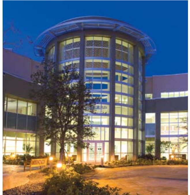
COURTYARD AT NIGHT

• Holistic Design Solution: approaching the building design from an experiential point of view.