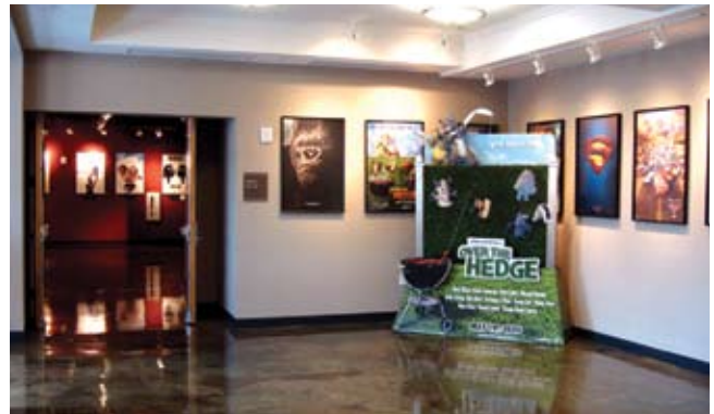
STUDENT WORK DISPLAY LOBBY

88,000-square-foot building of block construction with a cement plaster finish, to blend with the aesthetics of the surrounding campus buildings. It is strategically located among residence halls, a resource library, and the campus library to provide a centralized organization that