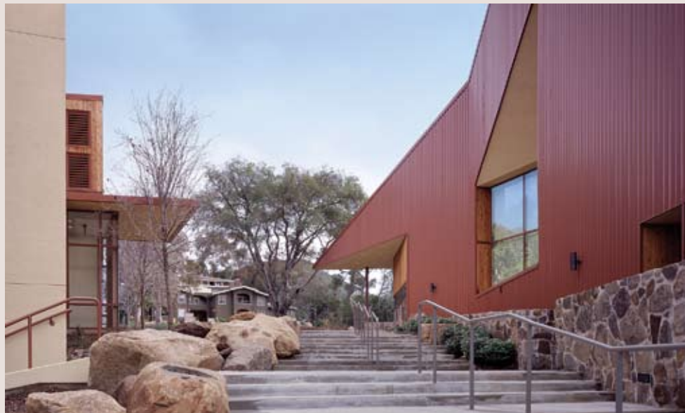
NEW VIEW CORRIDOR BETWEEN ARTS BUILDING AND COMMONS

Harley Ellis Devereaux / Barton Phelps & Associates