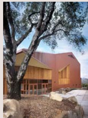
ARTS BUILDING AND NEW VIEW TO WEST

In addition to casually furnished spaces for student, faculty, alumni, and conference use, the commons provides lobby, reception, and rest room facilities for events in each building. Lower level music practice rooms are