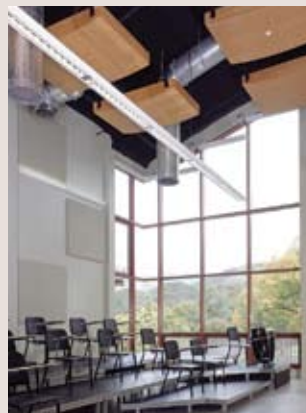
MUSIC REHEARSAL ROOM

The 450-seat auditorium in the arts building has mid-range acoustics for music, speech, drama, dance, and cinema. The cross aisle and lighting patterns allow the lower 300 seats to be used for daily assembly with the intimacy of a smaller room. Interiors are intentionally plain. As a teaching vehicle, stagecraft elements are exposed whenever possible. The building is approximately 16,000 square feet, with high-bay rehearsal rooms for music and dance located behind the stage, as well as a separately located control booth. The arts building takes advantage of the